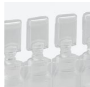
The twist-off cap is a closure design that has proven its worth millions of times and is used in a large number of production areas.

When it comes to deciding on the right tamper-evident seal for you, it essentially comes down to how the product will be used and whether it's for single or repeated use. But the one thing they all have in common is the fact that every container is hermetically sealed to create a fully functional closure for a clean, convenient, and practical result.