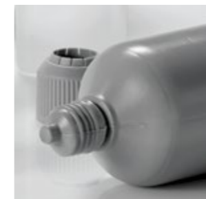
The KME closure is complemented by a screw cap with a mandrel. Screwing the mandrel in creates an opening through which the product can be dripped or squeezed out.