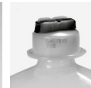
With the eurohead closure , the hermetically sealed container is combined with the eurohead cap. It was specifically designed to meet the requirements of infusion bottles (IV bottles).