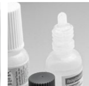
The KMT closure consists of two parts and allows the user to accurately dispense drops of the product.